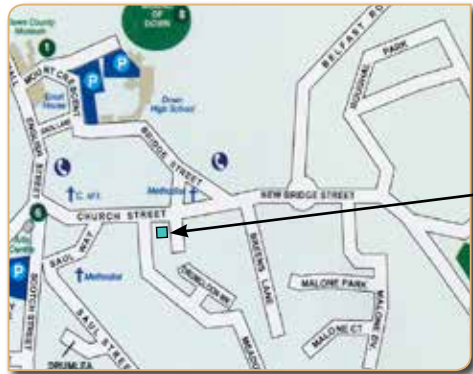
Charles Rourke & Sons

Memorials can be selected from a wide range available from our premises at 51 Church Street, Downpatrick.